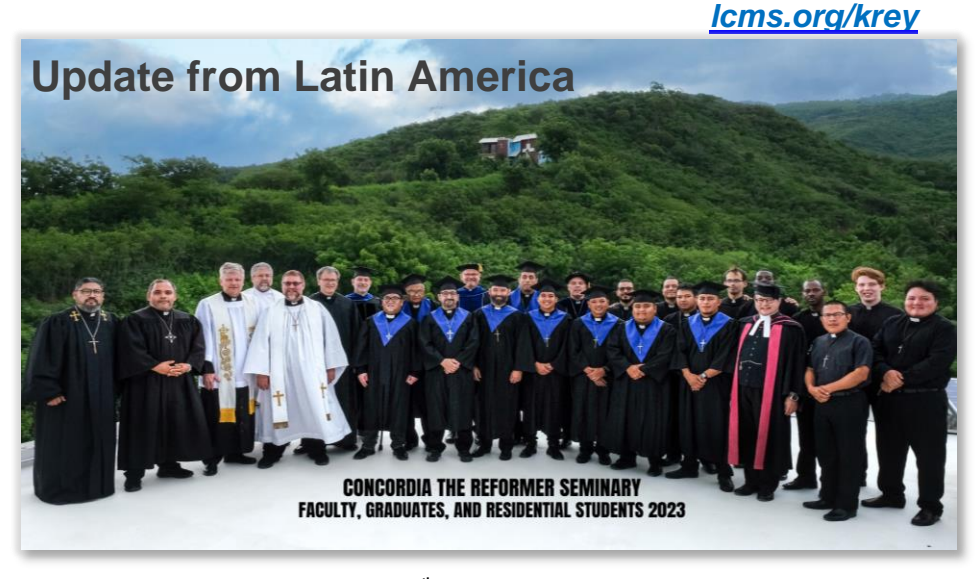
Seminary graduation of 10 men, May 26th 2023