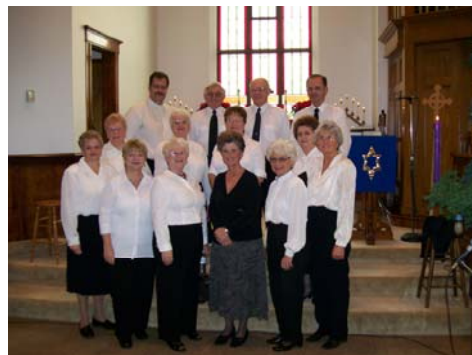
Choir at Grace Lutheran, Mitchell, ON