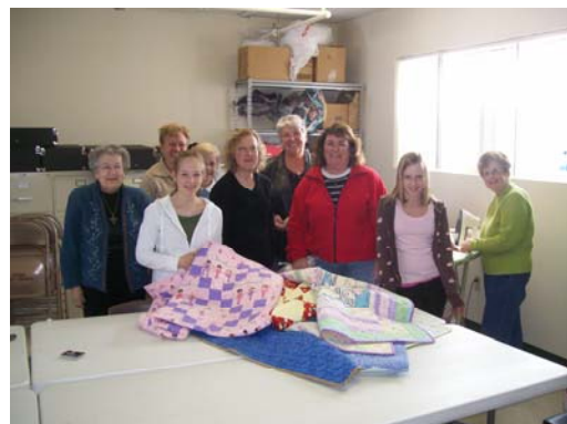
Quilt-makers at Peace Lutheran, New Berlin, WI

Jesus’ words and those of the New Testament are refreshing. They are a call to humble service. The example of our Lord is genuine, authentic, unvarnished, clear, and not self-serving. Whether it was washing the feet of His disciples or ministering to a woman caught in adultery or welcoming the children whom the disciples found to be a nuisance, Jesus revealed His overwhelming love in asking nothing for Himself. We have in Him the perfect model. Our parishioners have the example to follow and we pastors show them Jesus Christ.