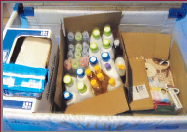
Baby Items for CareNet