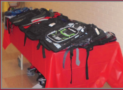
Backpacks for Family Services