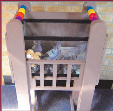
Dollars for CareNet

“Therefore, my dear brothers, stand firm. Let nothing move you. Always give yourselves fully to the work of the Lord, because you know that your labor in the Lord is not in vain.”