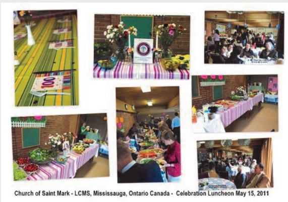
Church of Saint Mark - LCMS, Mississauga, Ontario Canada - Celebration Luncheon May 15, 2011